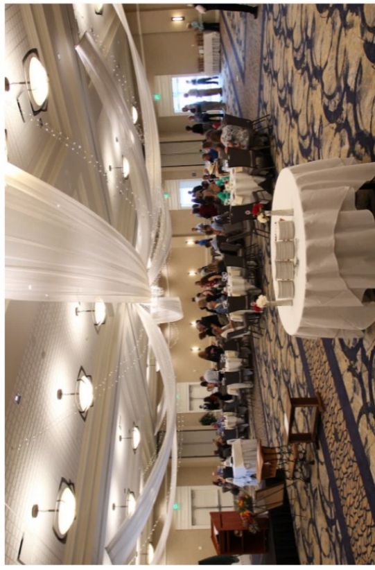
Thank you to all who joined the festivities to toast, reminisce and inspire the next century of work.