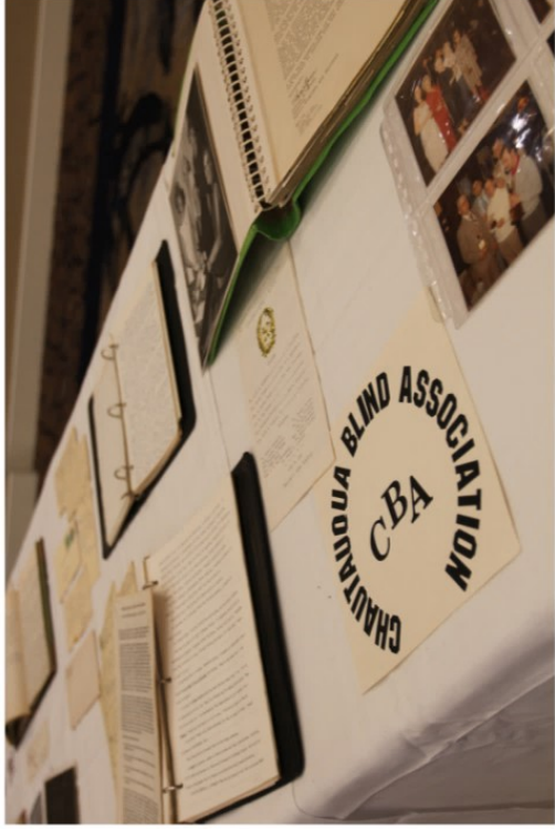
A glimpse of the 100 years of archive materials used to tell our story at the Centennial event on July 28, 2021.

The mission of the Chautauqua Blind Association is to enable people in Chautauqua and Cattaraugus counties with visual impairments to be active members of their community, to provide education regarding vision loss and to raise awareness of the importance of early vision screening for a lifetime of healthy vision.